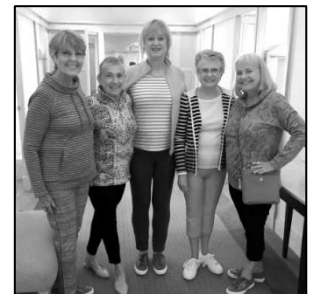
Talbot's Fashion Show Fundraising Fun in February

Sunday, November 6 WMHG Holiday Home Tour