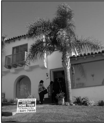
2014 Event Memories