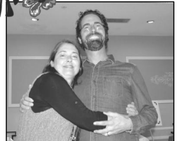
Hawaiian vacation prize winner!