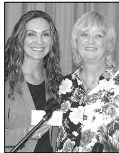
Check presented to AMCS